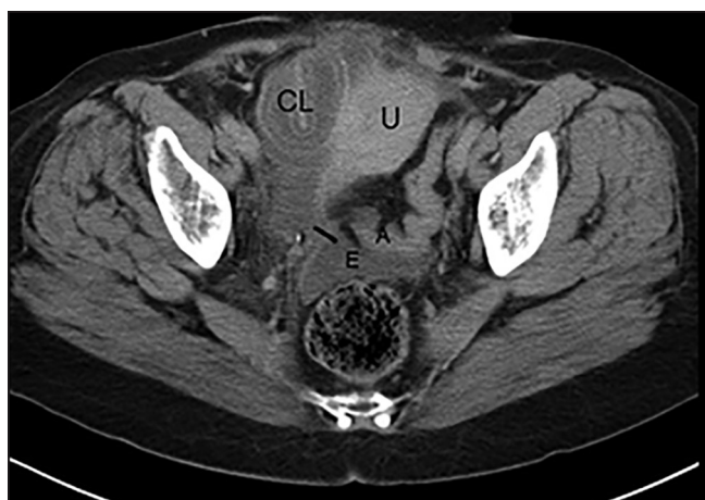
Figure 1: Computed tomography scan shows small bowel obstruction due to a broad ligament hernia (the black line at the defect), which is a closed-loop small bowel obstruction with a whirlpool sign closed loop (CL). The hernia located anterior to the uterus (U) pushing the uterus laterally to the left. Efferent and afferent ileal limbs (E and A, respectively.)

The patient had an uneventful postoperative recovery and was discharged home 5 days after surgery on oral antibiotic (cefuroxime 500 mg twice daily for 5 days). The histopathological report was consistent with gangrenous bowel.